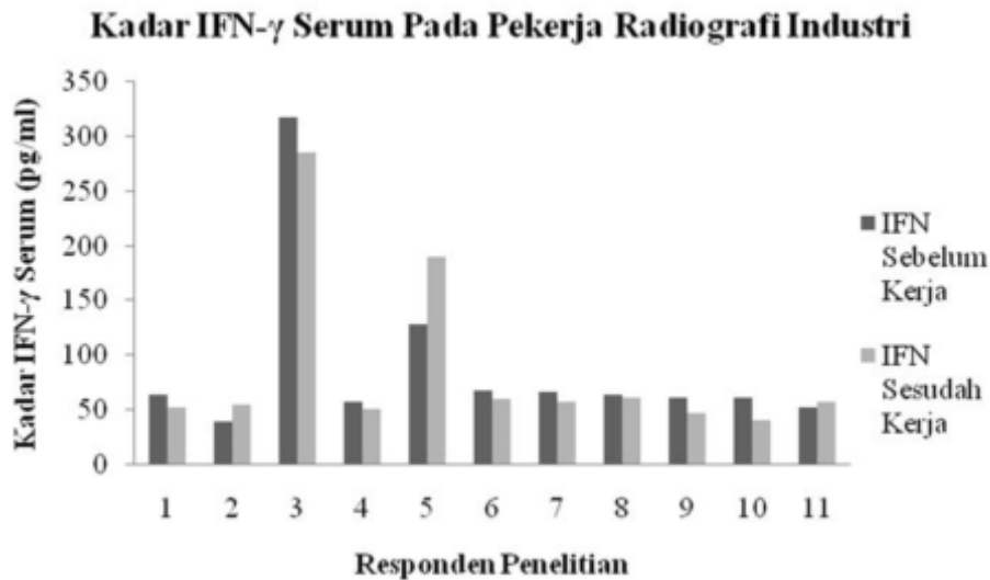
Fig 2. Tendency of Serum Level of IFN- \gamma Distribution in Industrial Workers

Figure 1 showed that monocyte count in generally workers is at normal range 2-8%. Figure 2 showed that serum level of IFN- \gamma in generally workers is at normal range 0-188 pg/ml.