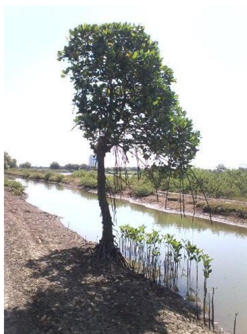
Figure 1. Mangrove Rhizophora mucronata

One of mangroves found in Surabaya East Coastal (Pamurbaya), East Java, Indonesia is the mangrove Rhizophora mucronata . This mangrove species is indigenous mangroves that ethno-botanically popular used as a pain reliever and dyes natural wood. Secondary metabolites contained in the leaves, bark, stems, roots, and fruit are different in quantity. The content of secondary metabolites in plant commonly used as a medicine is from general part of the bark. Therefore, on the basis of chemotaxonomic and ethno-botany of mangroves R. mucronata , this study aims to explore the bioactivity of antioxidant from the stem bark of R. mucronata .