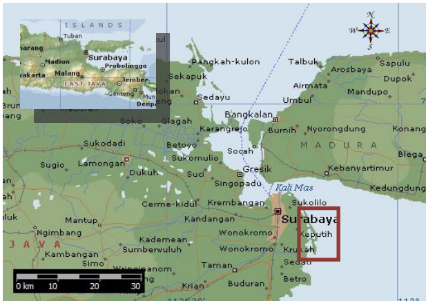
Figure 2. Map of the sampling site of mangrove R. mucronata in Pamurbaya

Samples of mangrove's bark, R. mucronata were obtained in Pamurbaya, Surabaya, East Java. Samples were then dried at room temperature and ground into powder. The total sample that has been obtained was 3 kg of R. mucronata powder.