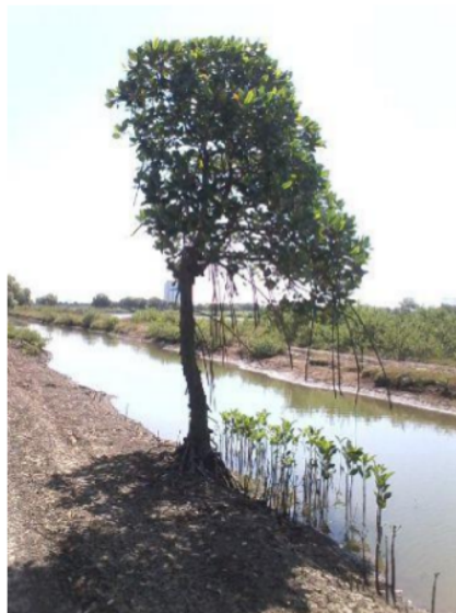
Figure 1. Mangrove Rhizophora mucronata

One of mangroves found in Surabaya East Coastal (Pamurbaya), East Java, Indonesia is the mangrove Rhizophora mucronata . This mangrove species is indigenous mangroves that ethno-botanically popular used as a pain reliver and dyes natural wood. Secondary metabolites contained in the leaves, bark, stems, roots, and fruit are different in quantity. The content of secondary metabolites in plant commonly used as a medicine is from general part of the bark. Therefore, on the basis of chemotaxonomic and ethno-botany of mangroves R. mucronata , this study aims to explore the bioactivity of antioxidant from the stem bark of R. mucronata .