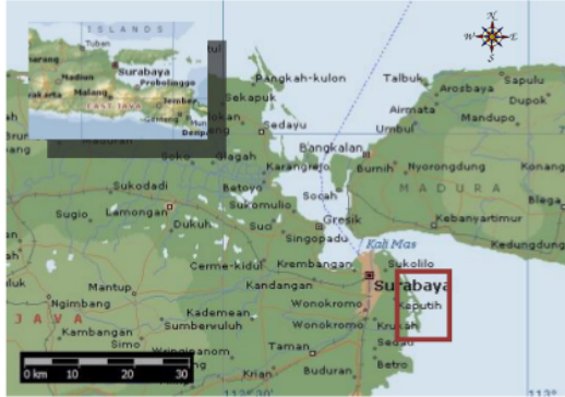
Figure 2. Map of the sampling site of mangrove R. mucronata in Pamurbaya

Samples of mangrove's bark, R. mucronata were obtained in Pamurbaya, Surabaya, East Java. Samples were then dried at room temperature and ground into powder. The total sample that has been obtained was 3 kg of R. mucronata powder.