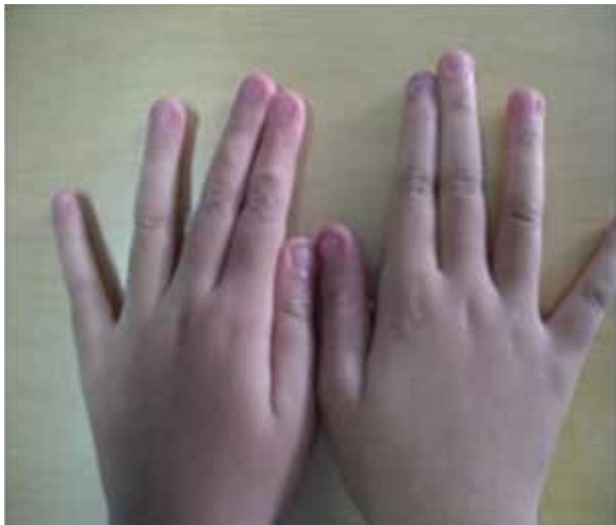
Figure 2. Gottron sign after treatment