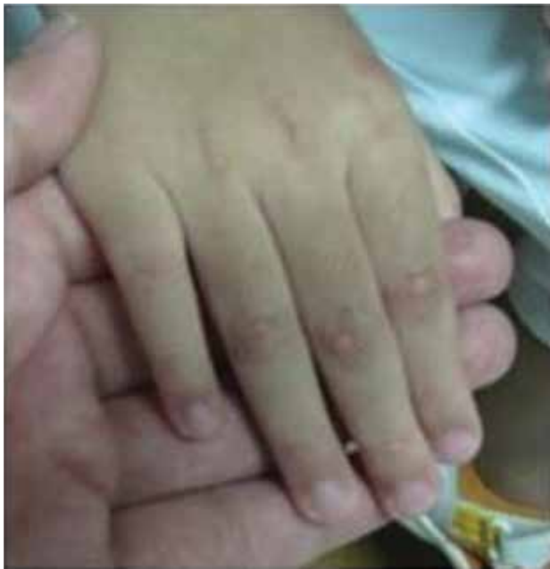
Figure 1. Gottron sign before treatment