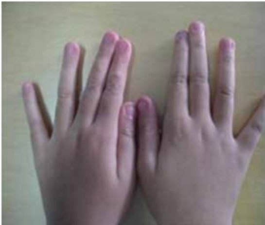
Figure 2. Gottron sign after treatment