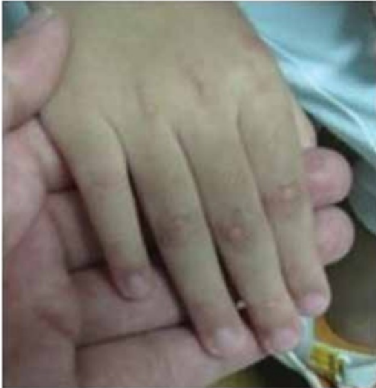
Figure 1. Gottron sign before treatment