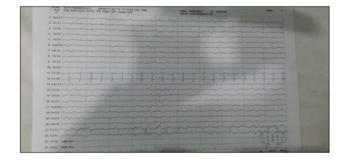
Figure 3: Electroencephalography revealed normal limit, no epileptiform waves are seen.