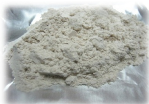
Figure 1. Natrium alginate powder of Sargassum sp .

Maximum water content of natrium alginate which had required by Food Chemical Codex 7 is 15%. The content of natrium alginate in food is at least 13%. 8 According to the research, 9 water content in natrium alginate was in the range between 5% to 20%. Water content of natrium alginate of Sargassum sp was 21.64%. It closed to the range of allowed water content of natrium alginate. There was no significant difference in this data (1.64%). This is because