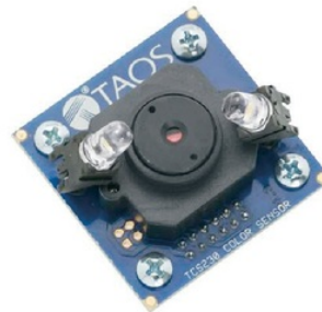
Figure 2. IC Microcontroller

Microcontroller is a digital electronic equipment which has on input, on output and a controller with a program which could be written and deleted with special manners. Microcontroller is a computer inside a chip which could be used to control electronic equipment so that it could be efficient and effective in cost. Electronic system usually needs many supporting components such as IC, TTL and CMOS. It could be reduced or minimized. It also has been focused and controlled by this "tiny controller" so that this electronic system could be compendious, faster, easy to modify and the distraction finding could be easier because the system is compact. 5