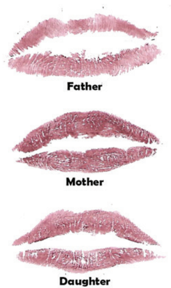
Figure 2 Recorded lip prints pattern obtained from one family frame.