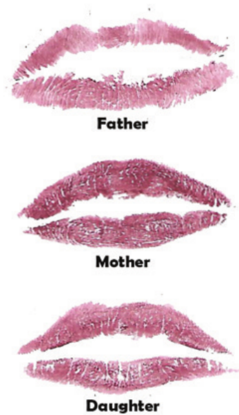
Figure 2 Recorded lip prints pattern obtained from one family frame.