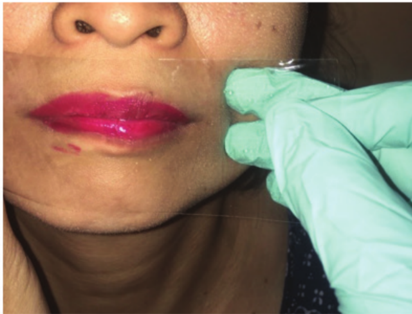
Figure 1 A scotch tape (5 x 12 cm) was gently stacked on the lips surfaces and removed smoothly with a single motion from left to right.

The subject was asked to set up straight with relaxed position of their lips. The research personnel cleaned up the lip's surfaces using a wet cotton swab and gently applied one layer of lipstick (Purbasari No. 83, PT Gloria Origita Cosmetica, Indonesia). After 2 minutes, a scotch tape (5 x 12 cm) was gently stacked on the lips surfaces and removed smoothly with a single motion from left to right (Fig. 1). The imprinted lip prints were then pasted on a white paper (Fig. 2) and analyzed using Suzuki and Tsuchihashi classification (Fig. 3). The blood groups (ABO) test was performed for each subject using antigen serum (Glory Widal Serology Test Kit, PT. Medika Farma Alkesindo, Indonesia).