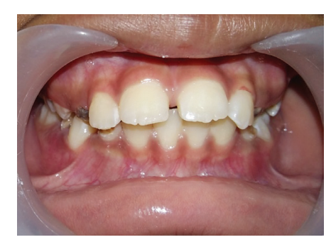
Figure 2. Intraoral profile of the patient.