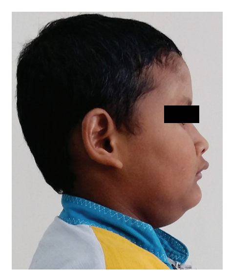
Figure 1. Extraoral profile of the patient.