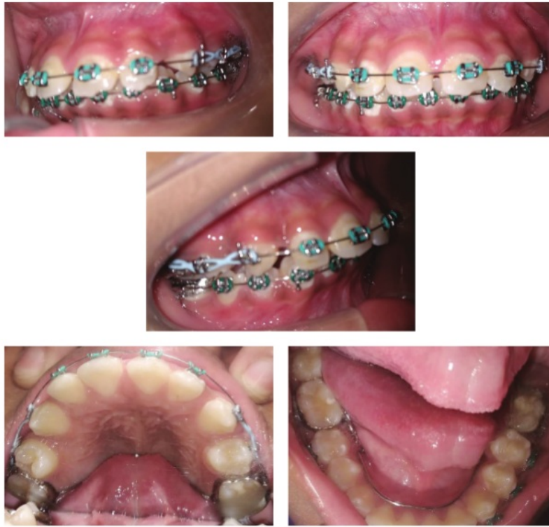
Figure 4. Intraoral (still in progress).

for a while by carrying him around and showing him things. After which he will calm down and sit in the dental chair and be cooperative again. After the first session and continuous interventions, the ADHD symptoms seem to get better evidenced by the patient being more cooperative, quiet and the parents expressed more understanding about the treatment.