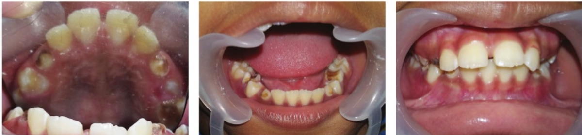
Figure 2. Intraoral profile of the patient.