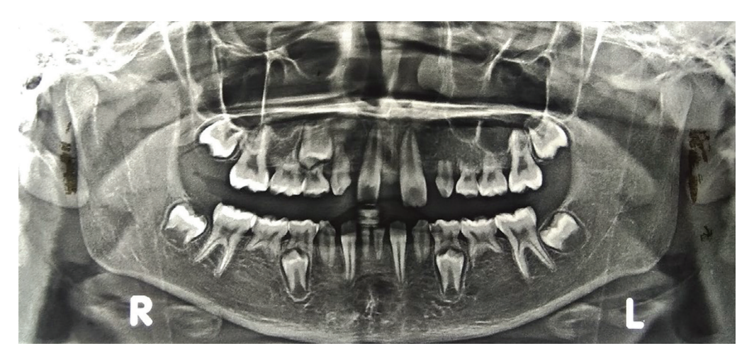
Figure 2. The panoramic photograph showing several ageneses.

518 ACTA MEDICA PHILIPPINA VOL. 53 NO. 6 2019