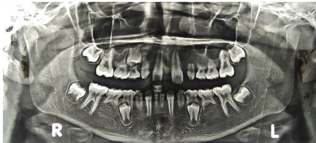
Figure 2. The panoramic photograph showing several ageneses.