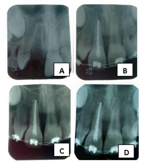
Figure 2. Periapical radiograph, A. Periapical radiograph before replantation of avulsed tooth; B. 1 week; C. 1 month D. 2 months after replantation of avulsed tooth.

Figure 1. Frontal view, A. Photograph before replantation of avulsed tooth; B. one day after replantation; C. one month after replantation, D. two months after replantation