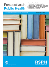
Perspectives in Public Health