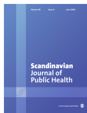
Scandinavian Journal of Public Health