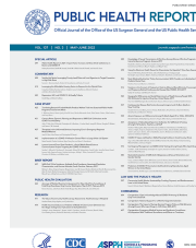
Public Health Reports