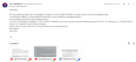
Screen Shot 2021-07-14 at 18.34.41.png 125K