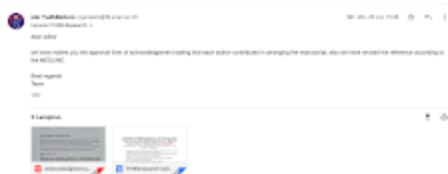
Screen Shot 2021-07-14 at 18.33.22.png 88K