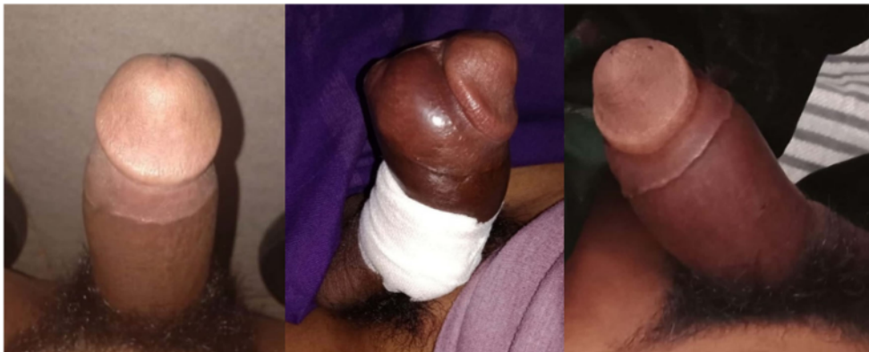
Figure 1. Penis at day 2, day 6 (after intracavernosal blood aspiration), and day 9.

On physical examination, there was no anemia and icterus. The spleen was palpable showing Schuffner 4 and Hackett 3. There was no enlargement of the lymph nodes. His laboratory findings were as follows: hemoglobin 10.4 g/dL; leucocytes