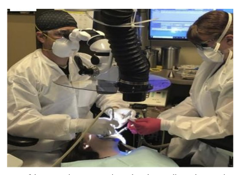
Figure 3. The setup of the evacuation system using polycarbonate disc and evacuation system<sup>23</sup>