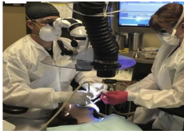
Figure 3. The setup of the evacuation system using polycarbonate disc and evacuation system 23