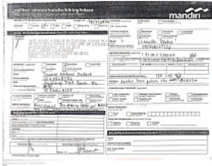
BPAYMENT RECEIPT FORTNJPR.jpeg 202K