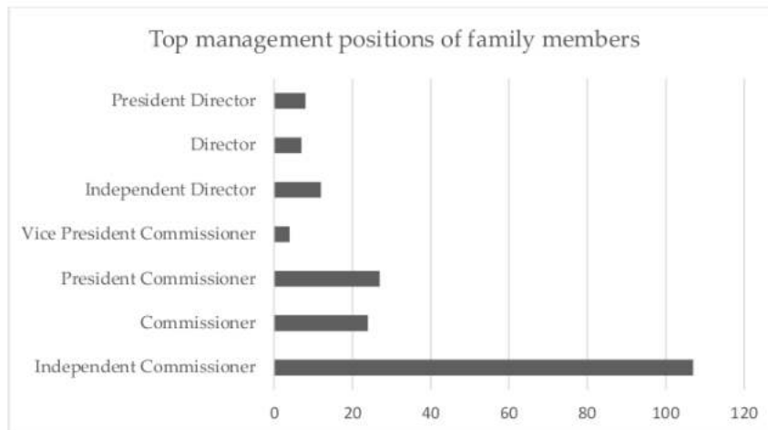
Figure 3. Distribution of political connections position in family firms with political connections.

Table 4 presents the Pearson’s correlation matrix for all variables used in this study. This matrix measures the dependence and direction of the linear relationship between two random variables (real-valued vector) (Zhou et al. 2017). The positive or negative sign indicates the direction and strength of the relationship shown by the number of asterisks, which is defined as the level of significance. The results shows that family firms negatively associated to the firm performance. We also find that family firms are less likely to hire politically connected directors in their board.