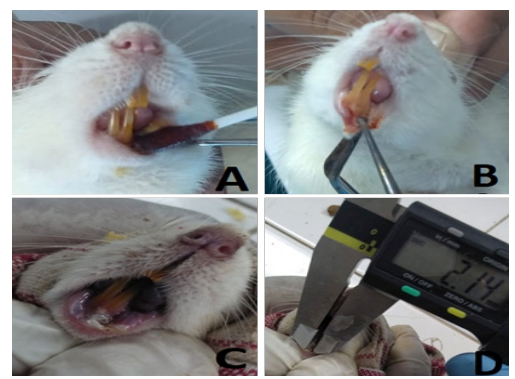
Figure 1. Ulcer induction in mucosa of experimental animal. A). Lower lip mucosa was smeared using 0.12% chlorhexidine digluconate; (B). Lower lip mucosa injured with a heated burnisher No. 4; (C). Traumatic ulcers Wistar rats appeared on day 3 after injured; (D) Ulcer was measured with digital calliper on day 3 until day 7

Results of the present study was shown in Table 1 to Table 4, respectively. The most decreased ulcer diameter was found in Group 1 which applied