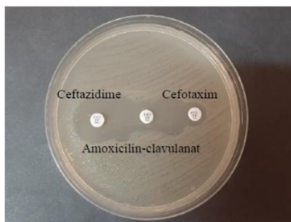
Figure 3. Extended Spectrum Beta-Lactamase (ESBL) producing E. coli by DDST

Previous studies have shown the spread of ESBL-producing E. coli from the surrounding area (Niasono et al. 2018). The human population can be exposed to antimicrobial resistant bacteria through encounter interactions with poultry sold in wet markets, which are the source of the presence of MDR and ESBL bacteria. This requires humans to be careful of poultry that can spread these isolates. However, more research is needed to understand how persistence and spread can be minimized (McEwen and FedorkaCray 2002).