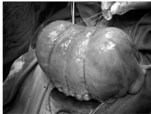
Figure 1. Surabaya Method (Modified B-Lynch suture).

The Surabaya Method was performed by brace suturing techniques with 3 paralel longitudinal stitches using chromic catgut no 2 with a curve rounded needle straightened manually. The uterus was exteriorized and assistant was pulling out the uterus to make low uterine segment thinner and easier to introduce needle from anterior to posterior low uterine segment wall. The first stitch was introduced into uterine low segment \pm 2 cm below Cesarean incision and medial of the lateral border or at a same plane in PPH following vaginal delivery. The needle was inserted at the ventral wall and let through posterior wall of the uterine isthmus. The second stitch with new thread was performed with same technique at contralateral site and the third also with a new thread was done between the first and the second stitches. The assistant performed manual compression to the uterine fundus to make anteflexed-inferior position while the operator tightened the threads and tied the uterine fundus 3 cm medial from left and right lateral border, and the third was tied between them. The second assistant observed the vagina, if there is no bleeding the abdomen wall was closed but if the bleeding persist, further surgical intervention needed.