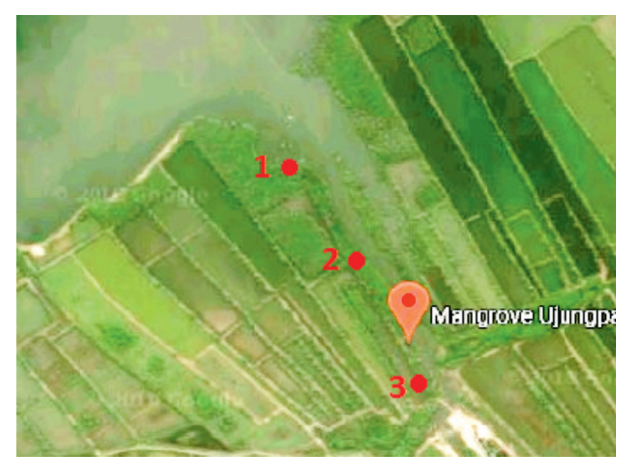
Fig. 1. Viewing of sampling locations in the Ujung Pangkah mangrove ecosystem. Note: 1. Location facing the sea, 2. Location close to the sea, 3. Location far from the sea.

Soil samples taken at several points refer to research conducted by Fatiqin (Fatiqin, 2011) which divides into three sampling areas which are far from the sea, approaching the sea, and dealing with the sea. Sampling was carried out at three locations (red dots) in the Ujung Pangkah mangrove ecosystem in accordance with the three point image. Each location was taken two samples from adjacent points each of 5 g. Samples are taken using pipes with a 5 - 20 cm depth from the surface where microbial activity can generally be found (Priyadarshini et al. , 2016). Samples were taken around the mangrove's roots because the microbes concentrationaround the roots