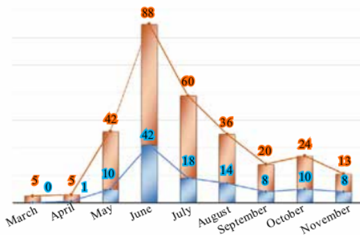
FIGURE 2. Number of Positive Covid-19 Screening Patients and Covid-19 Confirmed Patients (PCR +) Every Months. Patients with PCR (+) (top columns) and positive screening (lower columns)

From 109 SARS-CoV-2 PCR confirmed cases included in our study, we had 2 patients who presented in postpartum condition and out of 107 cases of pregnancy, the majority (102 cases; 93.6%) had delivery. There were 11 severe cases, all of which required intensive treatment and there