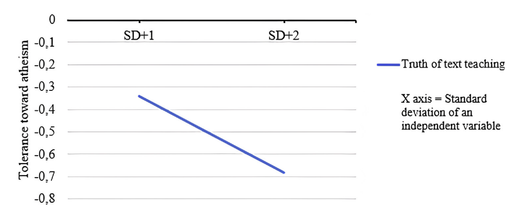
Figure 1. Standardised coefficient beta regression.

Note. * classified through the Ryan-Einot-Gabriel-Welsch range.