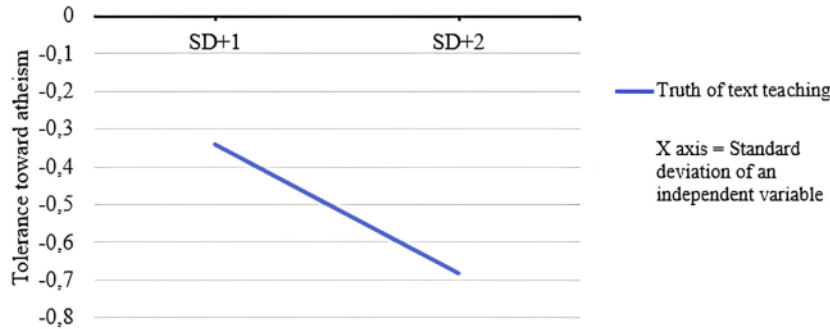
Figure 1. Standardised coefficient beta regression.

Note. * classified through the Ryan–Einot–Gabriel–Welsch range.