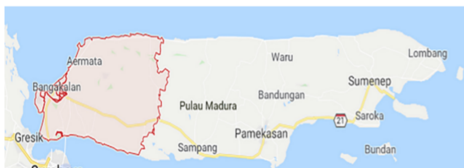
Figure 1. Bangkalan district, located in the western part of Madura Island, East Java Province, Indonesia

This cross-sectional study was completed in Bangkalan district, located in the western part of Madura Island, East Java Province, Indonesia (Figure 1). Bangkalan district was purposively selected by considering the highest number of poor households and the possibility of gathering wild edible animals. Two villages, namely, Blega village and Geger village, were randomly selected.