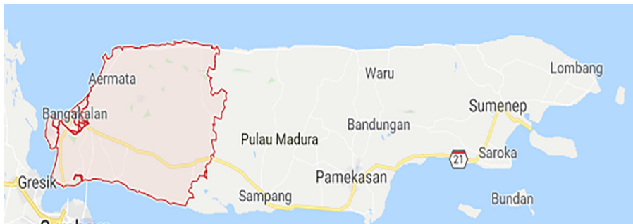
Figure 1. Bangkalan district, located in the western part of Madura Island, East Java Province, Indonesia

This cross-sectional study was completed in Bangkalan district, located in the western part of Madura Island, East Java Province, Indonesia (Figure 1). Bangkalan district was purposively selected by considering the highest number of poor households and the possibility of gathering wild edible animals. Two villages, namely, Blega village and Geger village, were randomly selected.