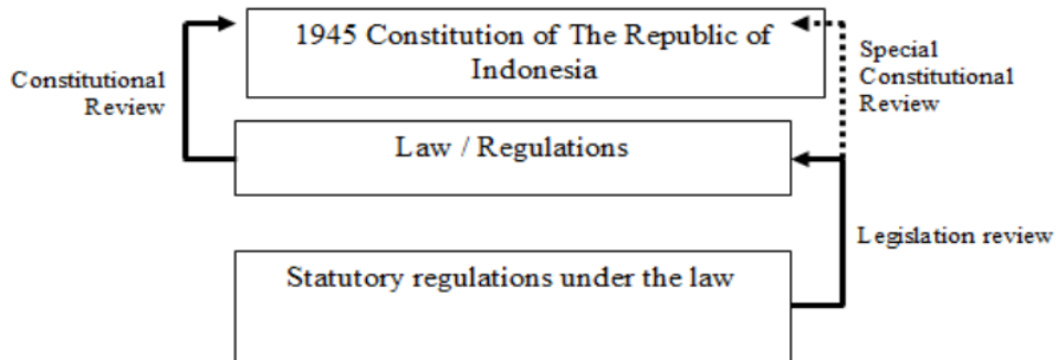
Figure 2. Concept Diagram of Judicial Review Integration in the Constitutional Court