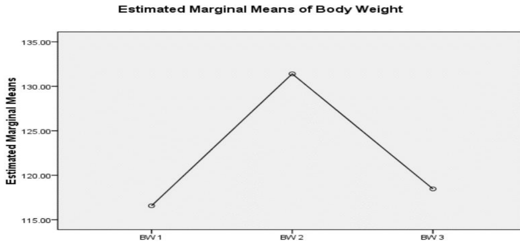
Figure 2 Plots of Estimated Marginal Means of Body Weight

< 0.05). However, the body weight measurement before treatment and after the end of the research is p > 0.05 and thus, it is concluded that there is no significant difference.