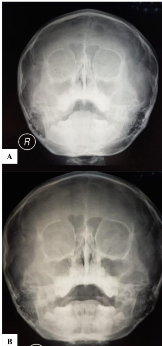
Figure 2. Water x-ray before being given house dust mites immunotherapy (A), after being given house dust mites immunotherapy (B) on Indonesian children with chronic sinusitis.

Fatigue symptom experienced by participants in the treatment group disappeared by 90% and 100% in week 7 and 14, respectively, with an average time of disappearance = 1.8 \pm 0.5 weeks. On the other hand, fatigue felt by participants in the control group disappeared by 81% in week 7, and 100% in week 14, with an