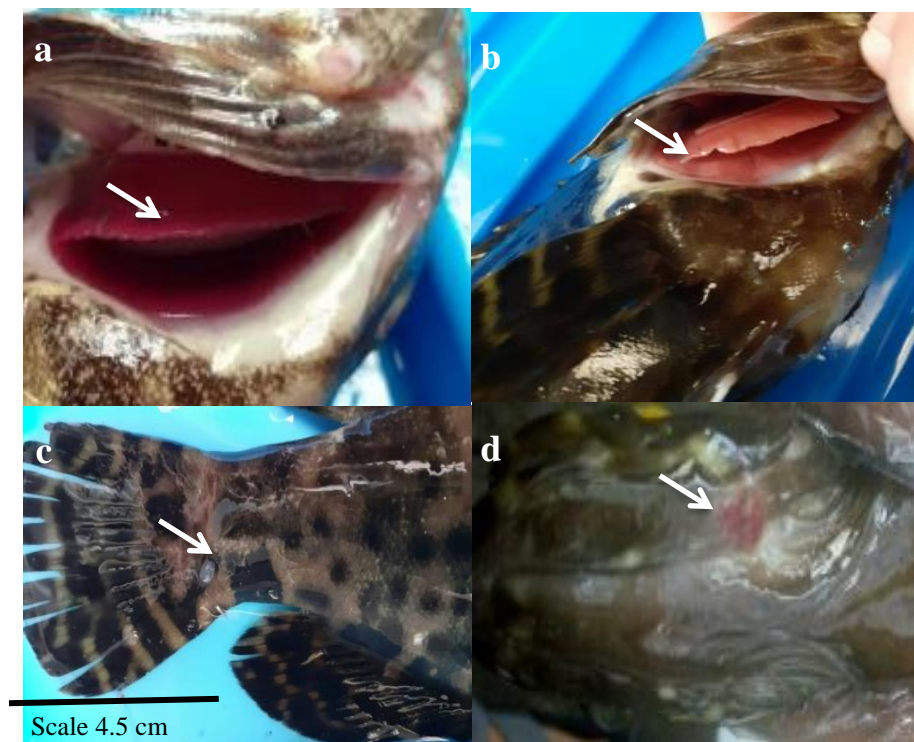
Figure 1. Anatomical pathology of grouper with Zeylanicobdella arugamensis infestation. Information: a. thickening of the gill lamellae; b. Sticky and irregular gills; c. Pale skin; d. red and swollen.

Observation of the anatomical pathology of fish began with the observation of clinical symptoms of fish infected with Zeylanicobdella arugamensis , namely swimming weakly in the column or on the surface of the water and staying at the bottom of the rearing tub. Anatomical pathology of gills and skin of grouper fish infected with Zeylanicobdella arugamensis , namely redness, swelling, and thickening could be seen in Figure 1.