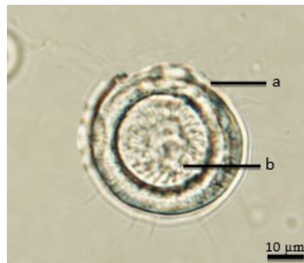
Figure 1. Trichodina sp. a. Cilia, b. Denticle

The results of the examination of the genus Trichodina sp. found on the surface of the body from the head to the caudal fins. Observations using a 100x and 400x magnification microscope showed that Trichodina sp. looks circular with a size of 10-120 \mu\text{m} .