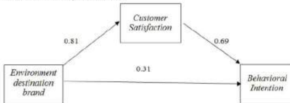
FIGURE 1. Path Analysis Test Results

The following is a table of path analysis results based on the path coefficient value: