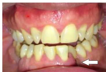
Figure 5. Intraoral clinical examination showed laceration on the anterior left lower gingival mucosa (white arrow), right edge-to-edge occlusion, laceration with displacement in the 31 and 33 regions and step off deformity \pm 3 mm inferiorly (white arrow).