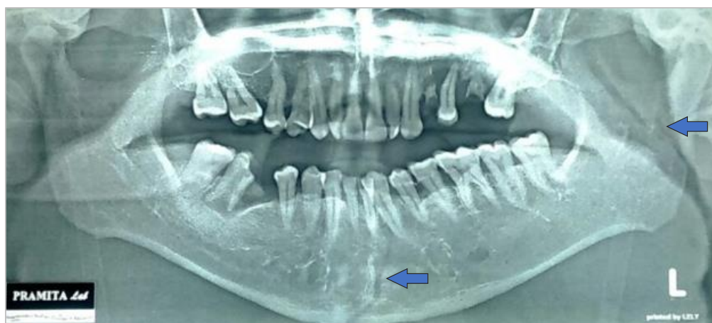
Figure 6. Panoramic radiograph showed fracture line in the left parasymphyseal mandible region mesial to tooth 33, and in the ascending ramus of the left mandible region to the left of the mandibular coronoid process (blue arrow).