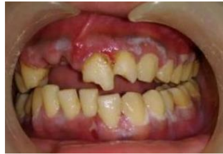
Figure 8. Intraoral clinical examination indicating laceration to the anterior lower gingival mucosa and \pm 1 mm inferior displacement in the 32 region, malocclusion, anterior and posterior open bite.

Case 4: A 23-year-old male presented the chief complaint of difficulty in chewing and closing the mouth due to a motorcycle accident six days prior to attending the hospital. Extraoral examination revealed laceration to the right anterior mandible region (Figure 7). Intraoral examination confirmed discontinuity in the symphysis region and malocclusion (Figure 8). A panoramic radiograph indicated the presence of a fracture line in the symphysis region, an anterior comminuted mandible fracture, and a left subcondylar fracture (Figure 9). On the basis of clinical