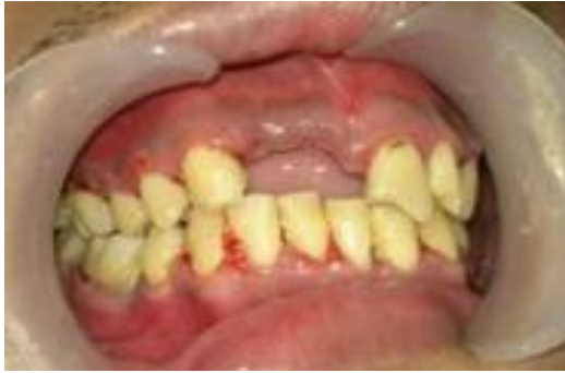
Figure 16. Intraoral clinical examination on 8 th week showed normal occlusion without anterior and posterior open bite.

two weeks. On the 86 th day, the subject presented no facial asymmetry (Figure 10) and normal occlusion (Figure 11 and 12).