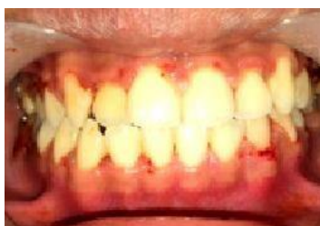
Figure 13. Intraoral clinical examination on 6 th week showed normal occlusion without anterior and posterior open bite.