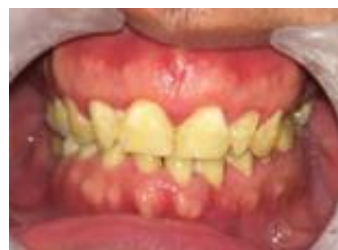
Figure 14. Intraoral clinical examination on 12 th week showed normal occlusion without anterior and posterior open bite, and no step off deformity in the 33 region.