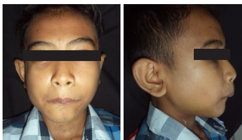
Figure 1. Extraoral clinical examination showing facial asymmetry.

Case 1: a 13-year-old male attended the Dental Hospital of the Faculty of Dental Medicine at Universitas Airlangga complaining chiefly of difficulty in chewing and closing his mouth as the result of a traffic accident 11 days earlier. The patient had been thrown off a moving motorcycle, his chin subsequently making hard contact with the asphalt. The patient was examined in hospital shortly after the accident without any treatment having been initiated. The individual in question had a history of fainting during the