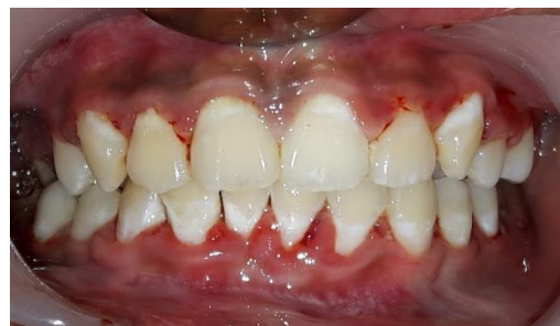
Figure 11. Intraoral clinical examination on 86 th day showed normal occlusion without anterior and posterior open bite.