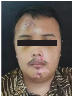
Figure 7. Extraoral clinical examination indicating minimal facial asymmetry, laceration on and swelling in the submental region.

anterior and posterior open bite, fracture with displacement in the 31 and 33 regions, step off deformity of \pm 3 mm, and instability in the left posterior mandibular region. A panoramic radiograph showed a fracture line stretching mesially in the left parasymphysis mandible from tooth 33, and in the region of the ascending ramus of the left mandible to the left mandibular coronoid process (Figure 6). Following clinical and radiological examination, this case was diagnosed as left parasymphysis and ascending ramus of the mandible fracture.