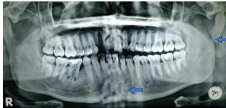
Figure 9. Panoramic radiograph showed oblique fracture line in the left parasymphysis mandible region to the distal tooth 31 region, and left condyle region (blue arrow).