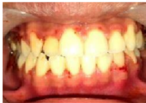
Figure 13. Intraoral clinical examination on 6 th week showed normal occlusion without anterior and posterior open bite.