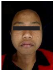
Figure 4. Extraoral clinical examination showing minimal facial asymmetry and submental swelling.