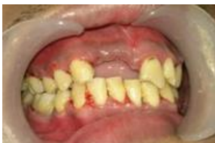
Figure 16. Intraoral clinical examination on 8 th week showed normal occlusion without anterior and posterior open bite.

two weeks. On the 86 th day, the subject presented no facial asymmetry (Figure 10) and normal occlusion (Figure 11 and 12).