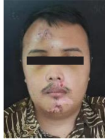
Figure 7. Extraoral clinical examination indicating minimal facial asymmetry, laceration on and swelling in the submental region.

anterior and posterior open bite, fracture with displacement in the 31 and 33 regions, step off deformity of \pm 3 mm, and instability in the left posterior mandibular region. A panoramic radiograph showed a fracture line stretching mesially in the left parasymphysis mandible from tooth 33, and in the region of the ascending ramus of the left mandible to the left mandibular coronoid process (Figure 6). Following clinical and radiological examination, this case was diagnosed as left parasymphysis and ascending ramus of the mandible fracture.