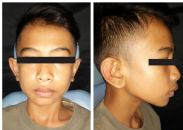
Figure 10. Extraoral clinical examination on 86 th day showed no facial asymmetry.