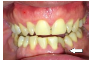
Figure 5. Intraoral clinical examination showed laceration on the anterior left lower gingival mucosa (white arrow), right edge-to-edge occlusion, laceration with displacement in the 31 and 33 regions and step off deformity \pm 3 mm inferiorly (white arrow).