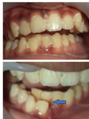
Figure 2. Intraoral clinical examination demonstrating anterior and posterior open bite, in addition to fracture with displacement in regions 41 and 42 and two overlapping mandibular incisors (blue arrow).

Extraoral clinical examination showed facial asymmetry, minimal swelling in the left buccal region and crepitation and tenderness in the left mandibular condyle region (Figure 4). Intraoral clinical examination showed limited mouth opening, malocclusion, anterior open bite, redness and minimal swelling, instability in the posterior mandibular region and step off deformity in the angle of the mandible region. A panoramic radiograph showed a fracture line in the left posterior mandible region distally from tooth 38 and