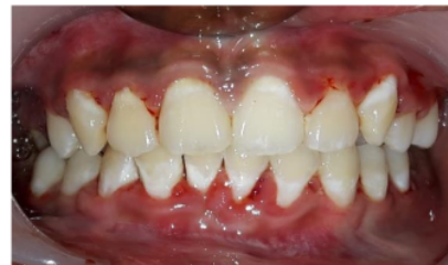
Figure 11. Intraoral clinical examination on 86 th day showed normal occlusion without anterior and posterior open bite.