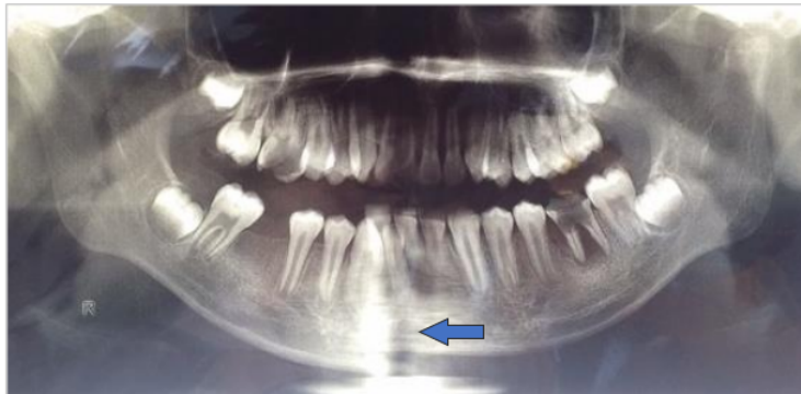
Figure 3. Panoramic radiograph indicating vertical fracture line (blue arrow).

Extraoral clinical examination showed facial asymmetry, swelling in the left parasymphysis and mandibular ramus region, deviation of the mandible to the right during mouth opening, as well as step off deformity in the parasymphysis and left mandibular ramus region with tenderness on palpation (Figure 5). Intraoral clinical examination confirmed limited mouth opening, laceration to the gingival mucosa of the anterior labial mandible, malocclusion,