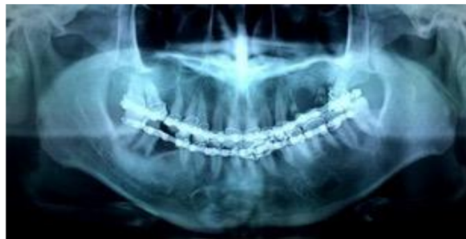
Figure 15. Panoramic radiograph after treatment showed no fracture line in the parasymphysis and left ascending ramus of the mandible region.