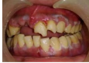
Figure 8. Intraoral clinical examination indicating laceration to the anterior lower gingival mucosa and \pm 1 mm inferior displacement in the 32 region, malocclusion, anterior and posterior open bite.