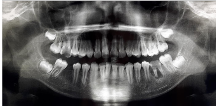
Figure 12. Panoramic radiograph after treatment showed union of symphysis mandible without fracture line.

During the first three days, elastic band application was performed laterally to reposition two separate bone fragments. During the subsequent three days, the traction direction was changed first to anterior and then to medial until the 20 th day. The IMF was subsequently changed using wire in the anterior and posterior region up to the 34 th day, which was then replaced by elastic bands up to the 48 th day. At that point, the IMF was removed, and the patient instructed to perform mouth opening and closing exercises in addition to following a soft diet for the ensuing