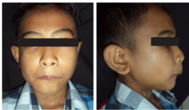
Figure 1. Extraoral clinical examination showing facial asymmetry.

Case 1: a 13-year-old male attended the Dental Hospital of the Faculty of Dental Medicine at Universitas Airlangga complaining chiefly of difficulty in chewing and closing his mouth as the result of a traffic accident 11 days earlier. The patient had been thrown off a moving motorcycle, his chin subsequently making hard contact with the asphalt. The patient was examined in hospital shortly after the accident without any treatment having been initiated. The individual in question had a history of fainting during the