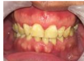
Figure 14. Intraoral clinical examination on 12 th week showed normal occlusion without anterior and posterior open bite, and no step off deformity in the 33 region.