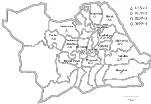
Fig. 1. Geographic distribution of DENV detected from Aedes mosquitoes in sub-districts of Surabaya between 2008 and 2015.

Two hundred ninety six pools and 34 pools were prepared from 15,099 Ae. aegypti and 1,506 Ae. albopictus , respectively, collected from the sample sites (Table 1). Of the 296 Ae. aegypti pools assayed, 109 (36.8%, 109/296) showed RT-PCR positivity; wherein 57 pools (52.3%, 57/109) were positive for DENV-1, 44 pools (40.4%, 44/109) were positive for DENV-2, 3 pools (2.8%, 3/109) were positive for DENV-3, and 5 pools (4.6%, 5/109) were positive for DENV-4. Of the 34 Ae. albopictus pools assayed, only 1 was positive for DENV-1. DENV-1 and DENV-2 were the most com-