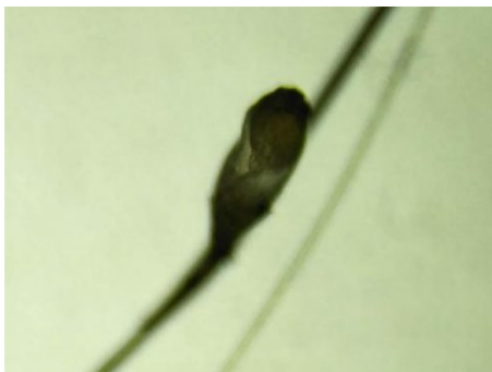
Figure 3. Egg of Pedicinus ancoratus . 40x magnification using a light microscope.

Based on this study, in addition to the adult stage, eggs were also found attached to the body hair of the Javan Langur in the thigh and stomach area. The egg has an operculum, is blackish white and is attached to the hair, this is in accordance with what was said by Taylor et al. (2016). Pedicinus ancoratus eggs can be seen in Figure 3.