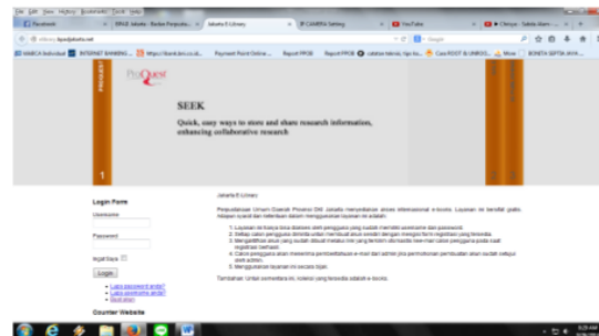
Fig 2:“E-Library” page

As seen in Fig.2, to access e-library, users must register by creating an account the link to which has been provided by the library. The e-library only serves a synopsis of the book, if someone wants to read all the content or borrow the book, they still have to visit the library. On this website there are no services for users with disability.