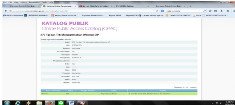
Fig 4:Catalog Page

are facilities of full digital books that can be accessed by the public, not just the synopsis. Fig.3 shows an example.