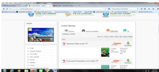
Fig 3:“E-Book” page

The collections displayed on this page are still very limited, so if a user needs to know another kind of collection, they have to come directly to the library. We can see the display of library OPAC in Fig. 4.