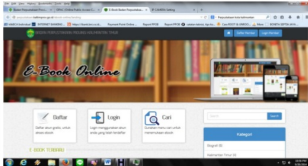
Table 1: Digital Library Websites in Indonesia