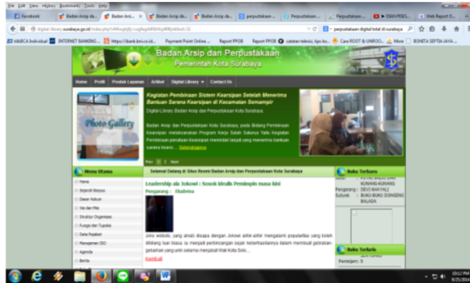
Fig 1: The “best seller”Page