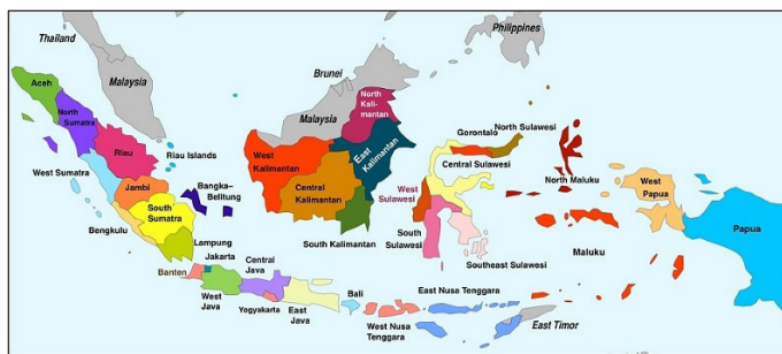
44 FIGURE 1. Indonesia Map