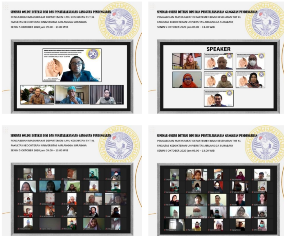
Figure 2. Online Seminar Activities on Early Detection and Management of Hearing Loss