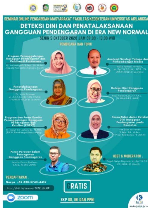
Figure 1. Online Seminars on Various Aspects that are related to Early Detection.

The online education method was carried out in the form of a seminar with the theme of early detection and management of hearing impairment and 1.484 participants attended it with 363 doctors (24,46%), 697 midwives (46,96%), and 424 nurses (28,58%).