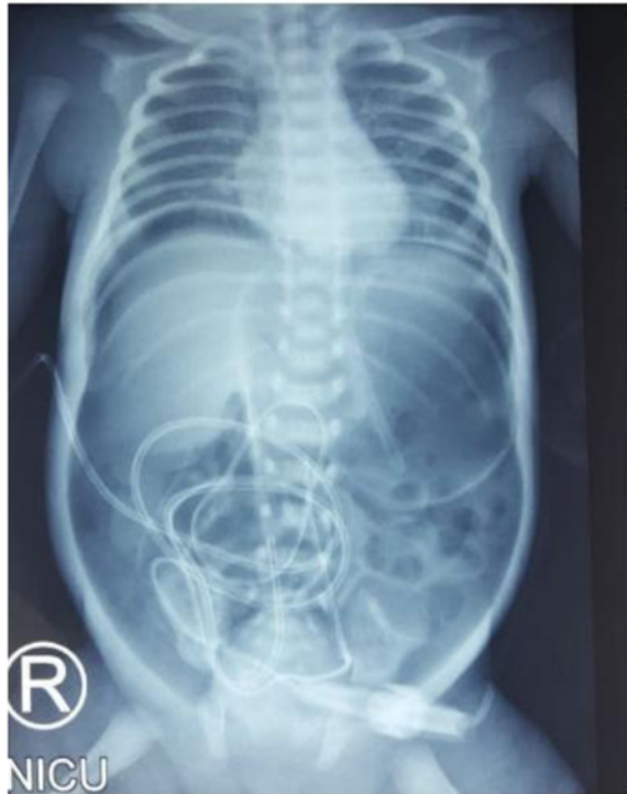
Fig. 1. Pneumoperitoneum: shadow appearance in x-ray shown the presence of air or gas in the right and left sub-hemidiaphragm, forming a continuous diaphragm sign, and surround the entire abdominal wall, creating a football sign.

The patient was still weak, vomiting was present while feeding, and no defecation was noted 24 hours after born. The infant was immediately treated with fasting, total parenteral nutrition (TPN) and albumin administration. In the next day, abdominal distention and meconium defecation were noted. The abdominal x-ray confirmed pneumoperitoneum (Fig. 1). The patient RT-PCR swab examination was