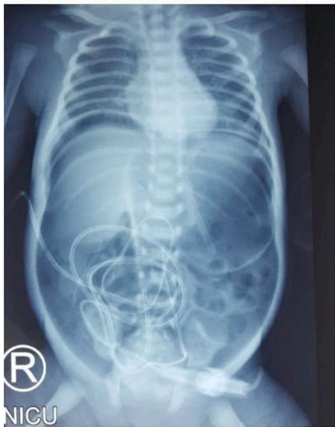
Fig. 1. Pneumoperitoneum: shadow appearance in x-ray shown the presence of air or gas in the right and left sub-hemidiaphragm, forming a continuous diaphragm sign, and surround the entire abdominal wall, creating a football sign.

The patient was still weak, vomiting was present while feeding, and no defecation was noted 24 hours after born. The infant was immediately treated with fasting, total parenteral nutrition (TPN) and albumin administration. In the next day, abdominal distention and meconium defecation were noted. The abdominal x-ray confirmed pneumoperitoneum (Fig. 1). The patient RT-PCR swab examination was