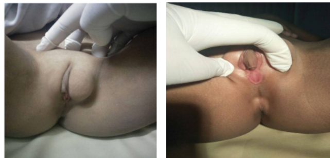
Figure 2. Results of external genitalia examination