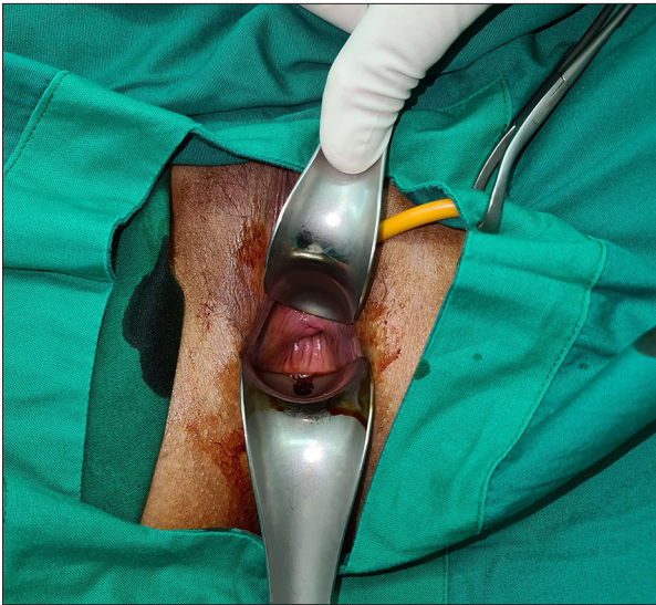
Figure 2. The cervix could not be visualized during evaluation under anesthesia in the operating theater. It was retracted cranially.