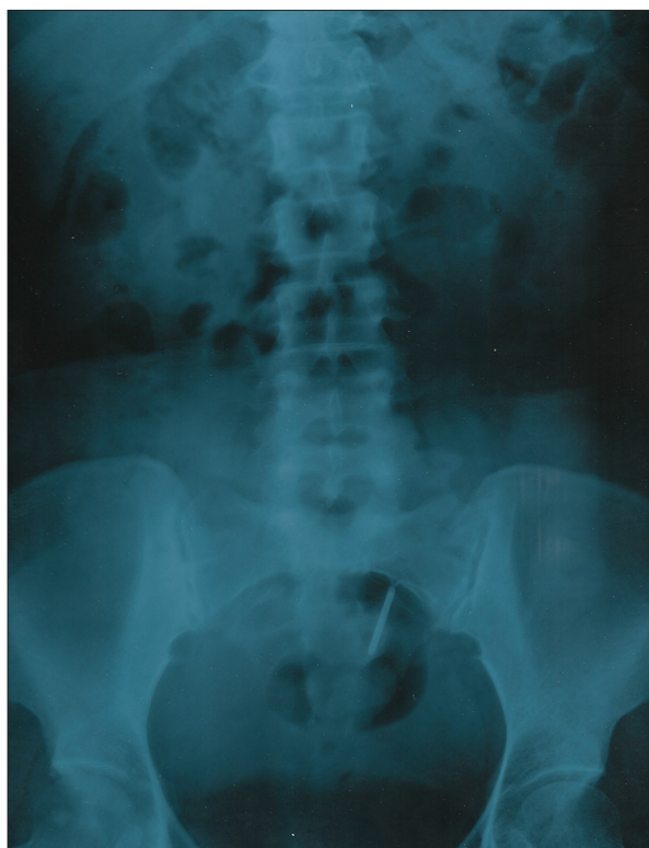
Figure 1. Plain abdominal radiograph showing the intrauterine device, which is to be pulled upward and obliquely because of the anatomical distortion of the uterus due to the adhesion to the abdominal wall.

A 43-year-old woman with a history of 3 cesarean sections visited an outpatient clinic with a 1-year history of intense pelvic pain. The indications for the cesarean sections were a breech presentation, recent cesarean section (within the preceding 2 years), and history of 2 previous cesarean sections. All cesarean sections were performed in a tertiary hospital with a Pfannenstiel incision. Adhesion prevention agents were not used in any of these surgeries. The last cesarean section was performed 7 years before the current presentation, and an IUD (Nova T; Bayer) was inserted 2 months after this delivery. No postoperative infection was observed after surgery and IUD insertion. Moreover, the patient did not develop any abdominal infection after IUD insertion.