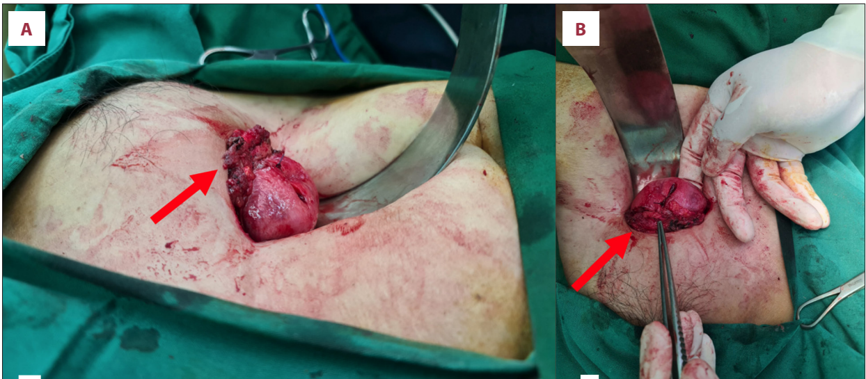
Figure 3. The uterus is pulled upward and adheres to the abdominal wall below the Pfannenstiel incision of the previous cesarean deliveries. The adhesion site (arrow) viewed from (A) left side and from (B) below.

scanning and magnetic resonance imaging (MRI) were not available in this hospital.