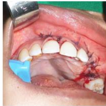
Fig. 6. Intra oral after cyst enucleation.