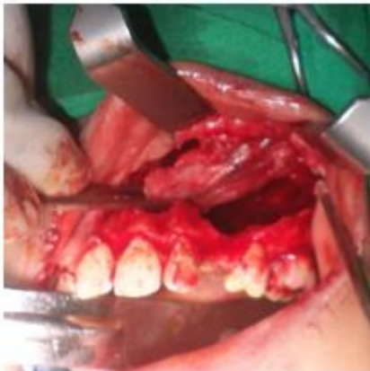
Fig. 4. Cyst space after enucleation.

The dentigerous cyst could easily be identified radiologically because of the typical radiographic view. Usually it is viewed as a simmetrical, unilocular, clear margin, and surrounding unerupted (impacted) tooth crown except for infected cysts which borders are unclear (Shear 2012, Pramono 2006). The slow and regular growth of the cyst, makes the dentigerous cyst have a distinct sclerotic border, with a clear cortex, and marked by a thin radiopaque border, especially if the cyst is relatively large in size or if there was a shift of the tooth position (Pramono 2006, Sudiono 2011).