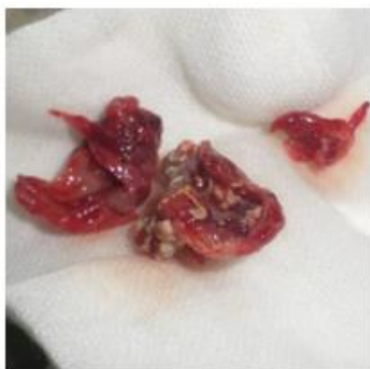
Fig. 5. Dentigerous cyst lesion.