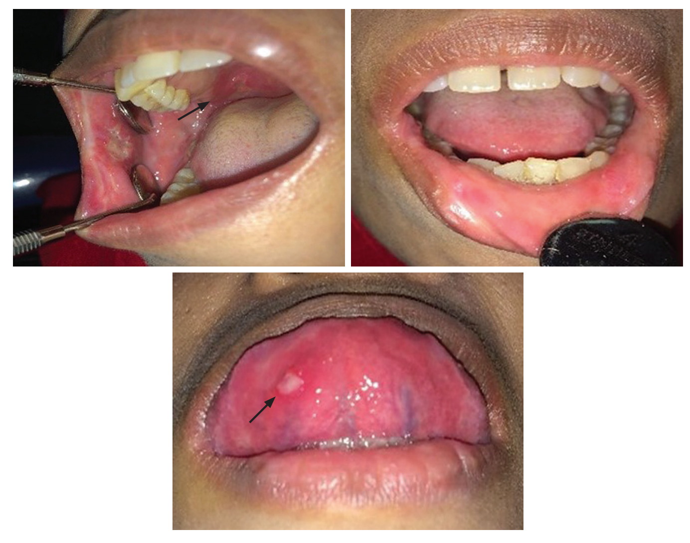
Figure 2. Ulcer on the labial mucosa heal, leaving ulcer on the palate, buccal mucosa and ventral tongue 0.5x1.5 cm, 1.5x1.5 cm and ø2 mm, white surrounded by erythematous area, clear border, irregular, painful.

beef, and duck white egg yolk. Even though patient had avoided foods that were likely to be allergens, new ulcers were still observed (Figure 2).