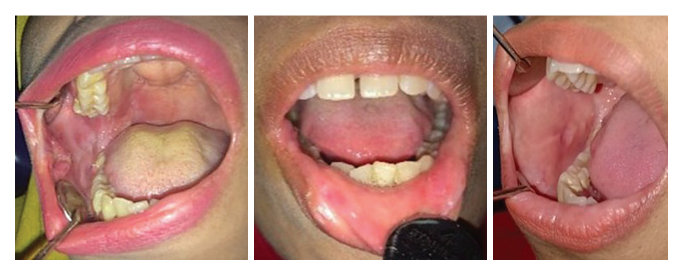
Figure 4. Ulcer heals.